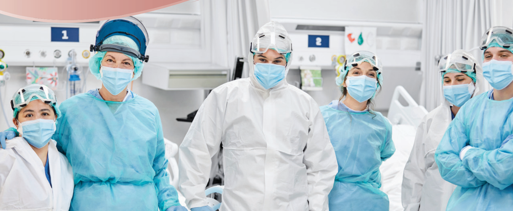
Health Care Heroes at work. ▲

St. Mary's health care workers are heroes in our community who deserve to be celebrated for their hard work and dedication. And this year, we've had lots of reasons to celebrate!