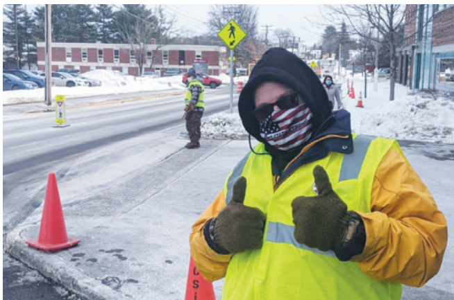
Captain America helping with parking and directions. ▼