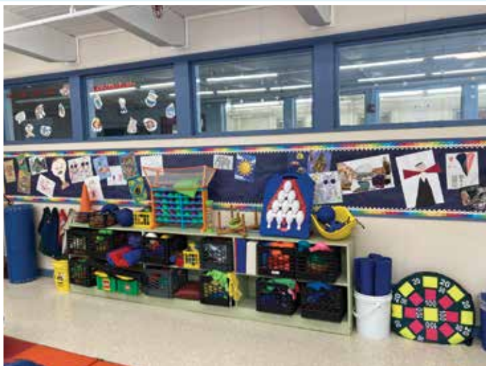
The physical therapy room is equipped with tools that help students develop their fine and gross motor skills under the direction of a therapist.