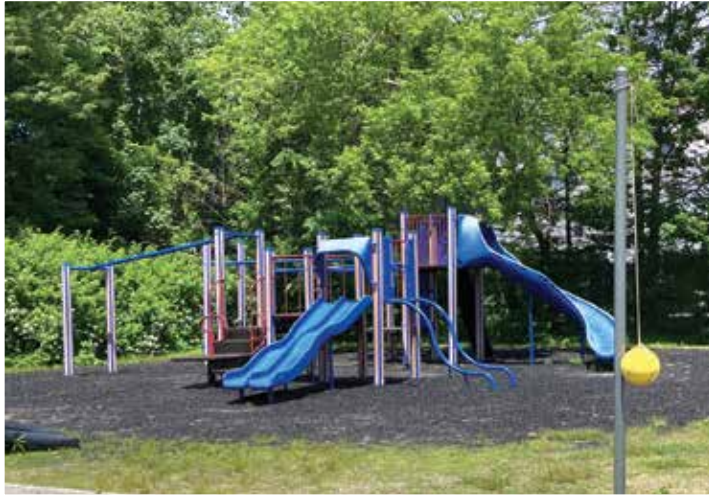
The school playground provides recreation and an opportunity to practice social skills in a non-classroom setting.