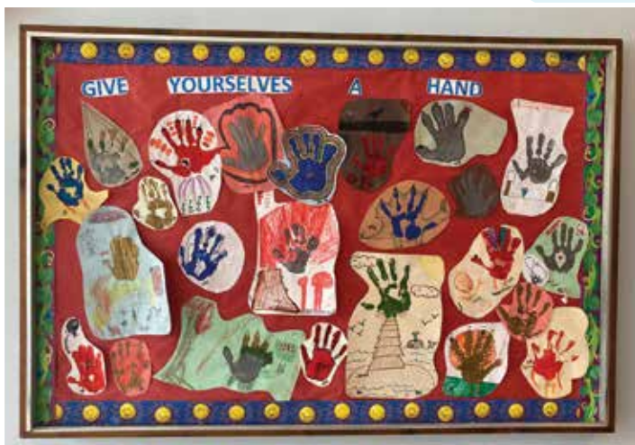
Celebrating successes is a regular part of the school's program.