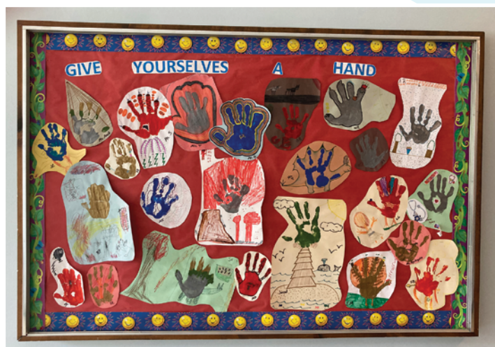
Celebrating successes is a regular part of the school's program.