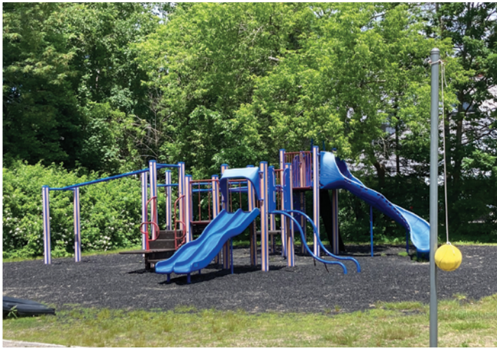
The school playground provides recreation and an opportunity to practice social skills in a non-classroom setting.