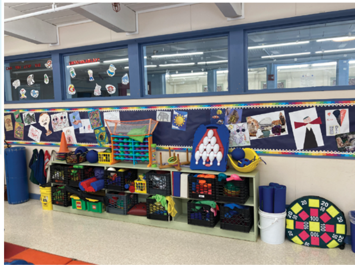
The physical therapy room is equipped with tools that help students develop their fine and gross motor skills under the direction of a therapist.